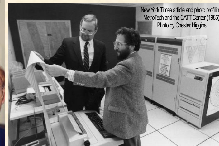
New York Times article and photo profiling MetroTech and the CATT Center (1985).